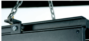
P1000 Uni-Strut Bracket System

For projects that require a motorised screen at 6100mm wide or over, the bottom roller design gives the best possible lay flat for these challenging installations.